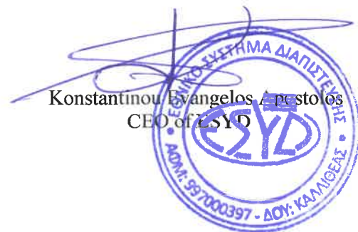
Konstantinou Evangelos Apostolos CEO of ESYD

This Scope of Accreditation replaces the previous one dated 25.09.2025. The Accreditation Certificate No. 1099-6 , according to ELOT EN ISO/IEC 17021-1:2015 is valid until 09.06.2030. Athens, 28.11.2025